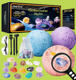
Gemstone Dig Kit