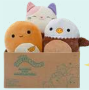
Crayola Silly Scents art case & mystery Squishmallows