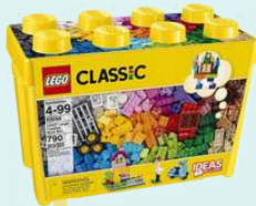
Ninja kindness game & Legos box