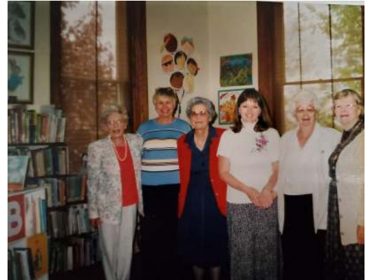
2001 Open House for new Branch Manager: