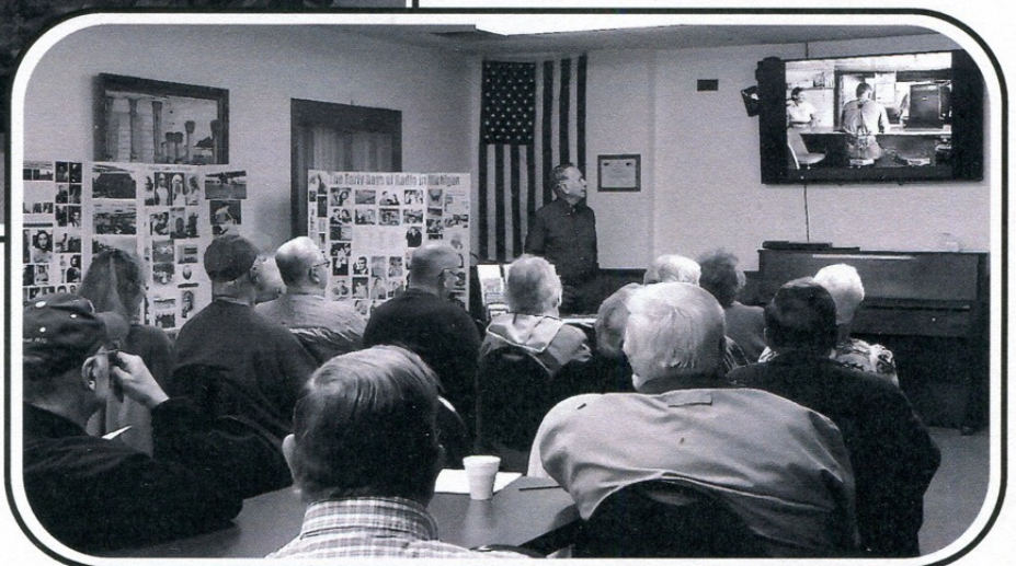
The Early Days of Radio in Michigan program was enjoyed by many. →

The only thing that you absolutely have to know, is the location of the library. Albert Einstein