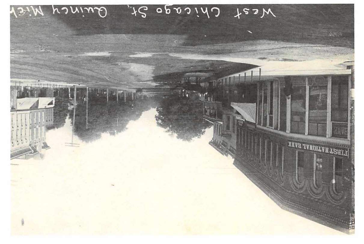
Current site of the Citgo gas station.