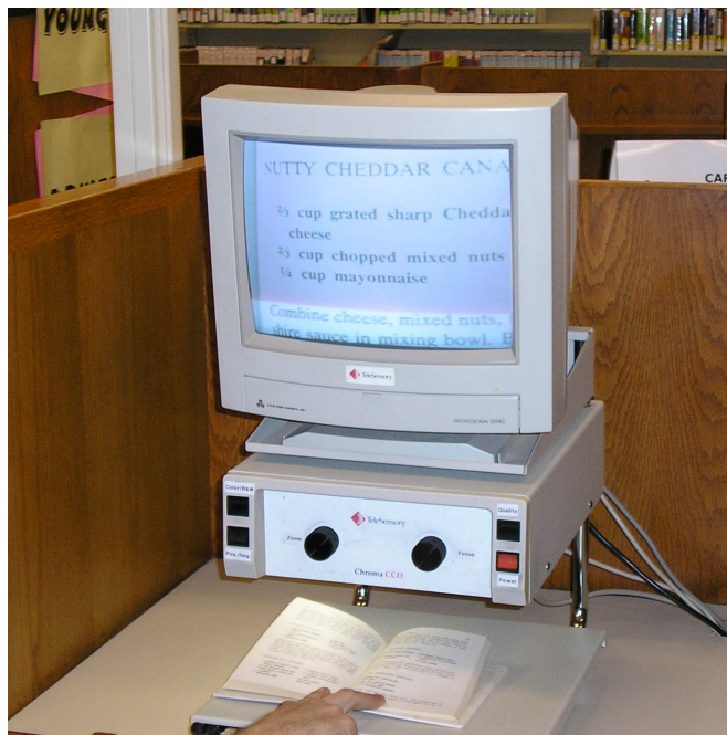
Make that small type readable!

The large print reader is located on the ground floor of the Coldwater branch adjacent to the Large Print book collection. If you are a large print reader, or just need some help with small type at times, give the TeleSensory large printer reader a try the next time you visit the library.