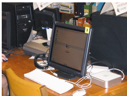
Small but mighty