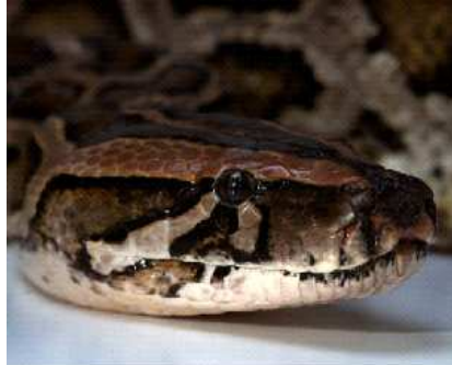
S-s-see you at the Zoomobile!

B oys and Girls and Children of all ages! The Zoomobile is coming to town. The Binder Park Zoomobile will be visiting Branch County on Friday, April 8th . It will be at the Algansee Public Library at 580-B S. Ray Quincy road at 10:00 AM . and will visit the Cen-