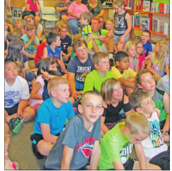
Dozens of local youth attended the recent event at the library.

was made possible through the generosity of Southern Michigan Bank and Trust and is part of the Kids' Place Summer Reading Programming. For more in-