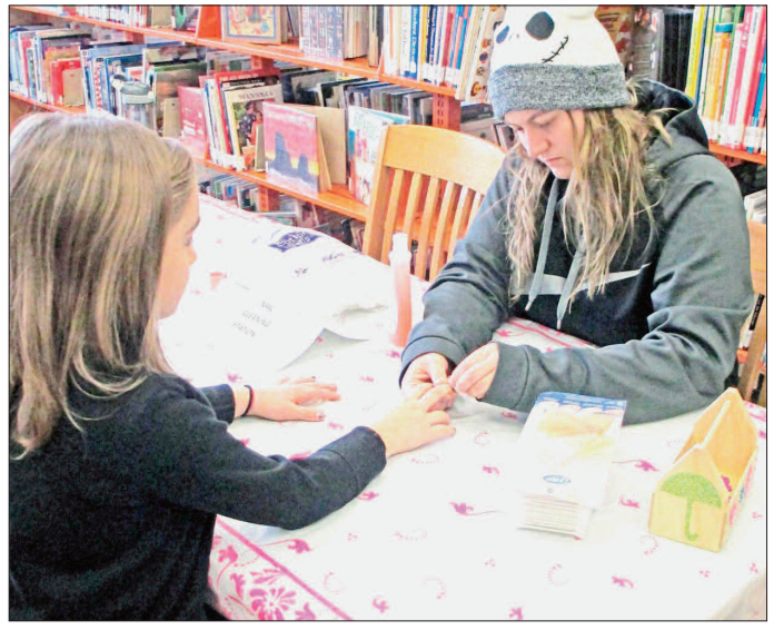
Above and below, members of the Girl Scouts Troop 80928 helped area youth paint their nails, build boxes and more at the Kids' Place Saturday.

Coldwater Daily Reporter, January 18, 2018, page A1.