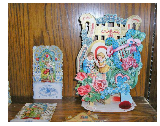
Vintage Valentine's and a wooden box collection belonging to Lynell Eash will be on display through February.