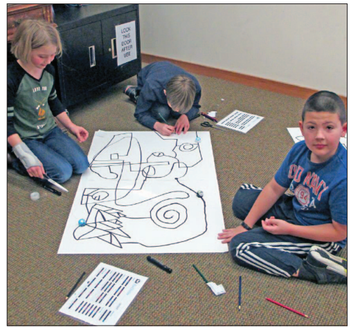
Tweens work together on their design.