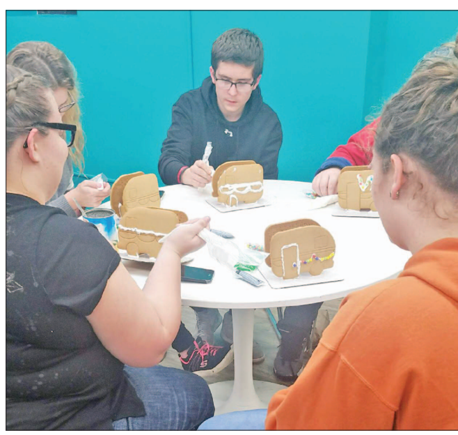
Youth build gingerbread houses during the recent holiday as part of the teen programming at the Branch District Libraries.