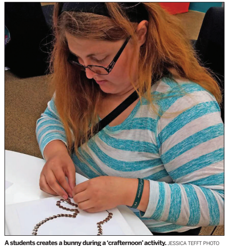
A students creates a bunny during a 'crafte