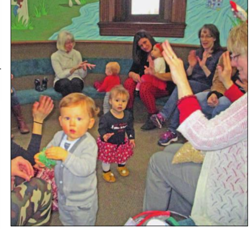
Youngsters up to 18 months old enjoy laptime with their parents at the Kids' Place last week. Laptime is offered every Monday at the Coldwater branch of the Branch District Library