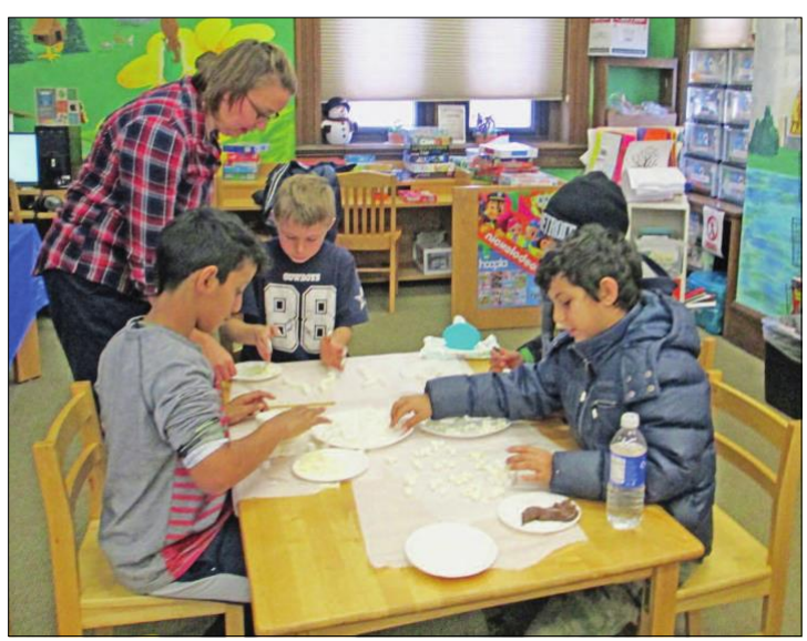
Local tweens create winter-themed items during the Branch District Library's "Tweens" event, held on Sunday the BDL Kids' Place in Coldwater