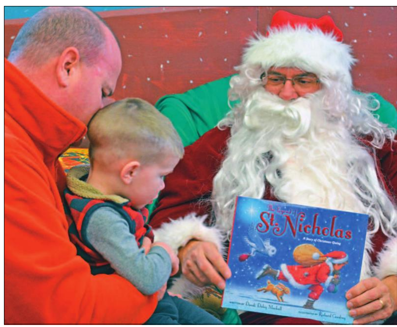
Above, Santa visits with a young boy at the library during the Christmas event Saturday. Below, Santa reads "The Legend of St. Nicklaus" to those attending the library event.