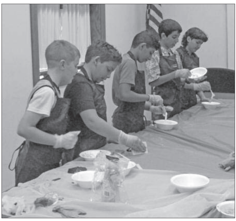
Kids participated in the tweens program at the library earlier this month.