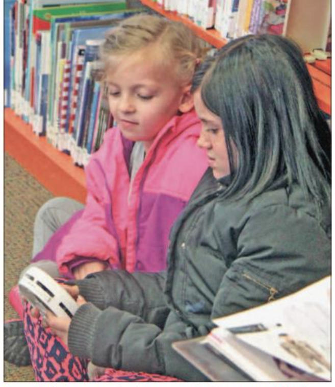
Two girls look at a smoke detector as the instructors of the library event discuss how one works and where they should be placed in a home.

Students learned coping skills and how to stay safe during an emergency. They also received a pillowcase to personalize as a preparedness kit.