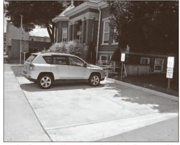
New handicapped parking completed at Quincy Library/township hall.

Once plans are issued from the architect, bids can be taken for the work to finalize repairs. The slate roof was already replaced on the historic building.