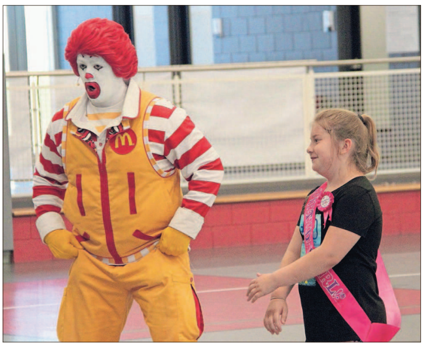
nald McDonald sings happy birthday to a little girl during the Summer Reading Program kick off on Wednesday.