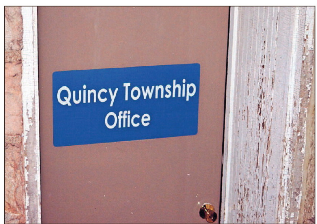
The rotted wood door frame at the Quincy Library.