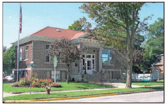
Bronson Branch Library has many events coming up.

BRONSON — The Bronson branch of the Branch District Library has a full schedule of events for the whole family.