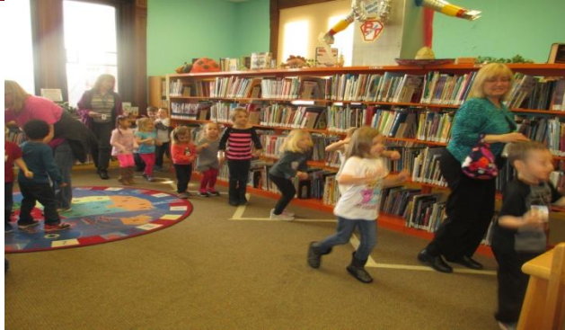
Practicing our Bunny Hops!