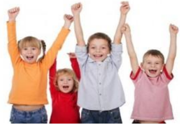
Oh, the fun we had!