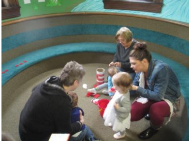
Until next time!!