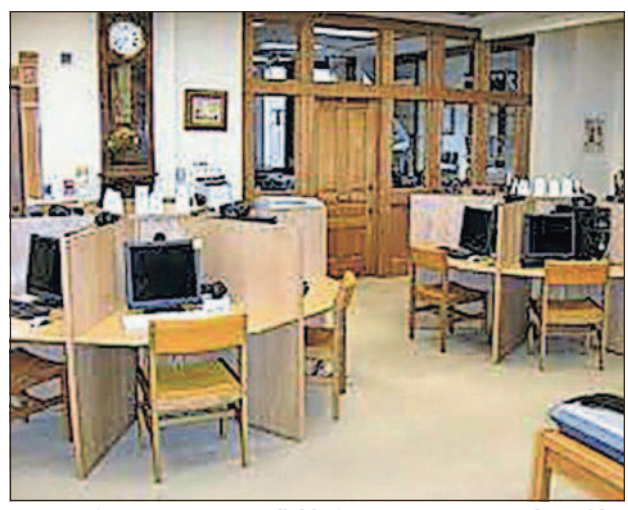
Dozens of computers are available for patrons to use at the Coldwater branch of the Branch District Library.