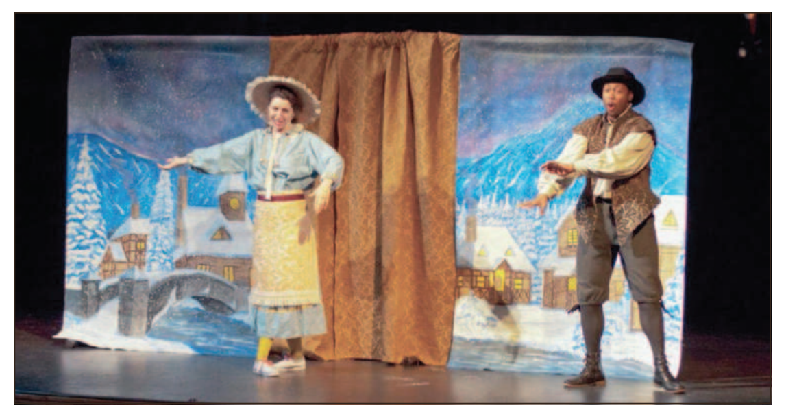
Coldwater Noon Rotary sponsors Winter Fables performed by Bright Start Touring Group.

Coldwater Daily Reporter , Tuesday, February 2, 2016, page A3: