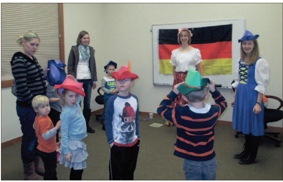
Local youth learn about German culture through songs, dance, crafts and food.

hrough the Kiwanis Club Traveling Tales adventure, local youth traveled to Germany with the Grimm's Brothers tale: "The Bremen Town Musicians".