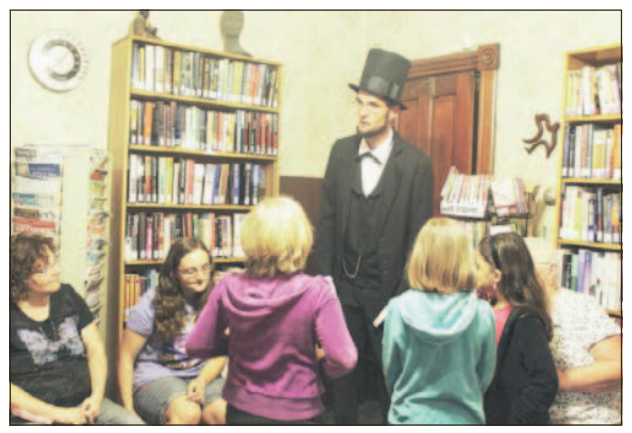
Abe Lincoln shares his stories with Algansee Library patrons.

The library is hoping to gain some exposure through their summer program and invites all interested to fill out their survey and visit their special events during their new hours: noon to 6 p.m. Tuesday; 1-6 p.m.