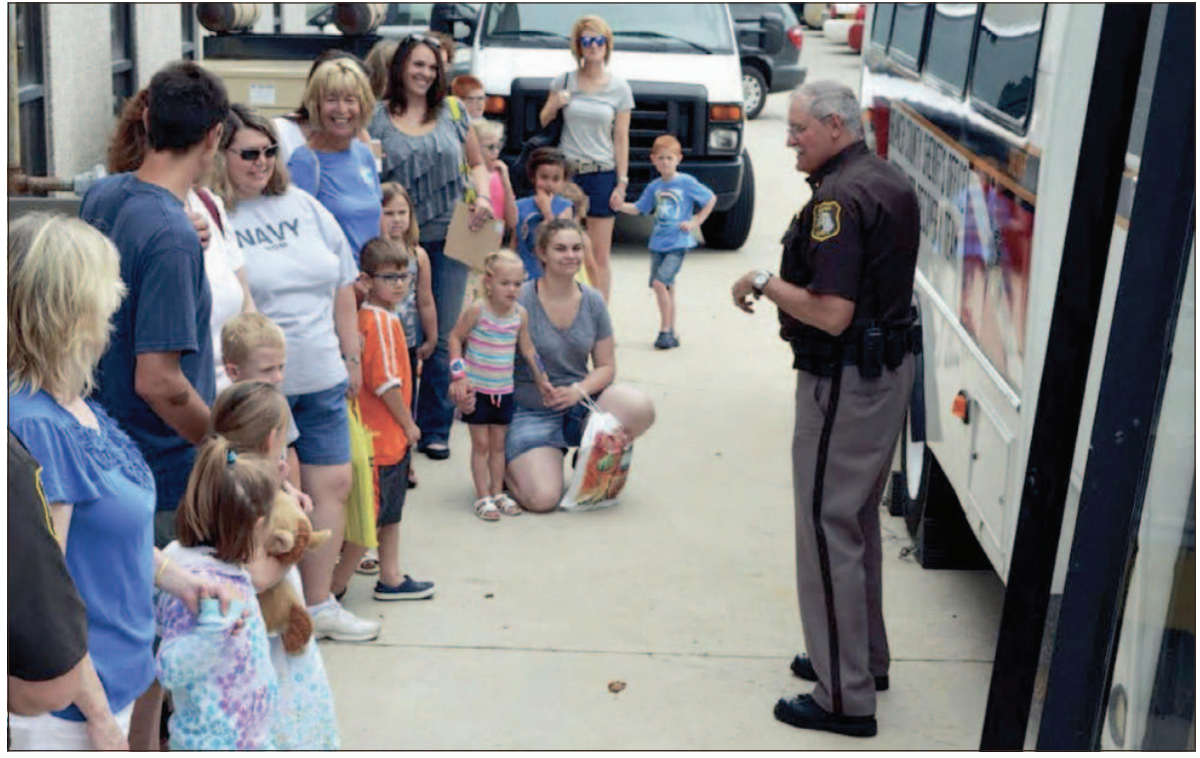
Kids gather near the dive team bus before taking a tour.