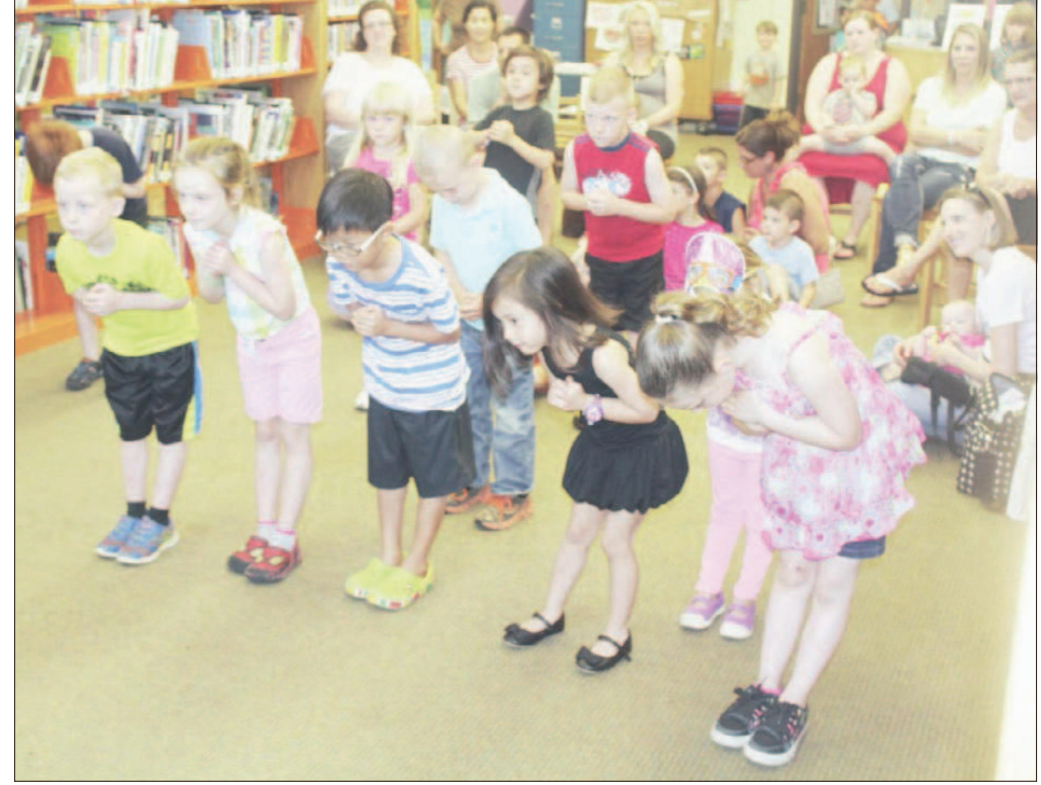
Kids learn to bow and learn the meaning of respect by using appropriate body language.