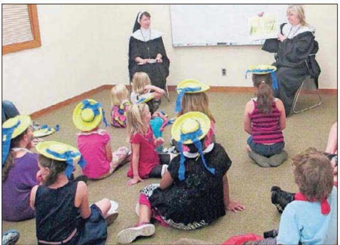
Many dress the part of characters in the Madeline books.