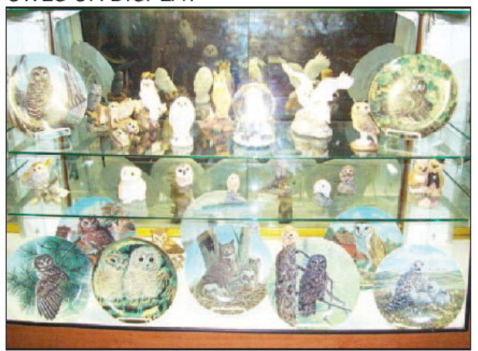
Judy Groholske's owl collection is showcased now at the Coldwater branch of the Branch District Library through the month of April. Groholske volunteers in the Holbrook Heritage room.