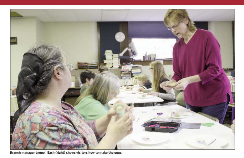
EGG-CITING CREATIONS *

The Bronson Library hosted an elegant Easter Egg making event Thursday, giving local residents something to do during spring break