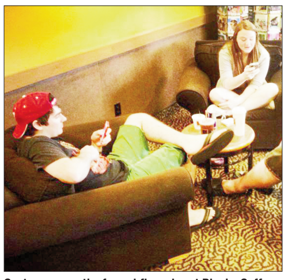
Customers use the free wi-fi service at Biggby Coffee in Coldwater.

The Branch District Libraries offer free wi-fi and in-house computers are also