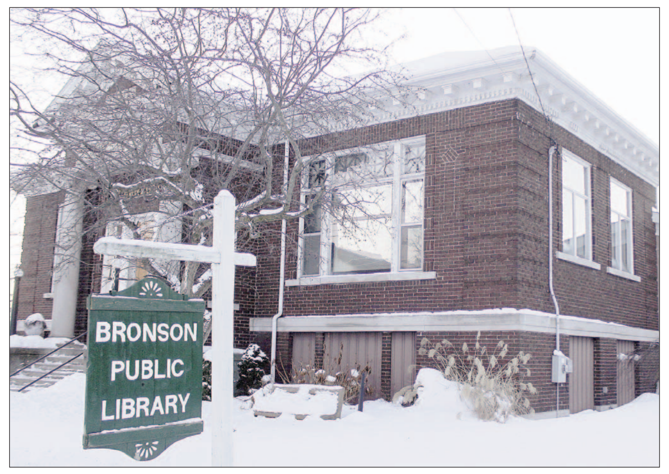
The Bronson Branch of the Branch District Library is one place where Branch County residents go to find out about their ancestors.