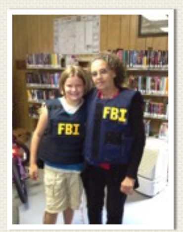
FBI Visit @ Sherwood Branch