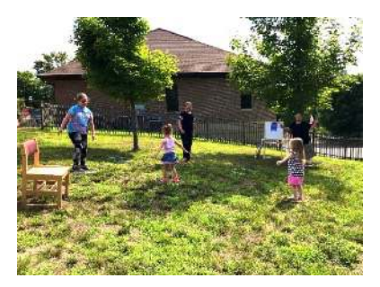
Union Twp. Story Time