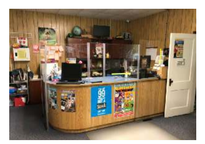
Plexiglass Barriers Ready!