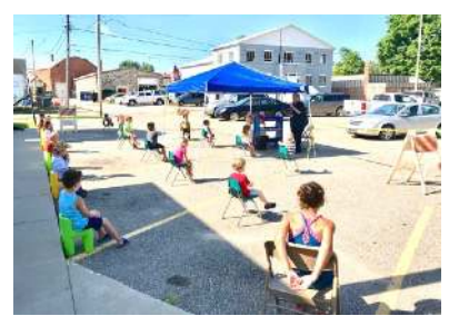
Bronson Story Time