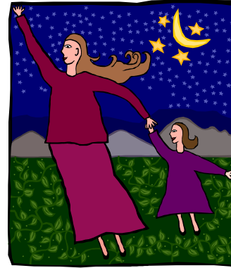
Open New Worlds—Read A Book—You'll Be Glad You Did.