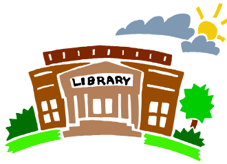
This library has a lot of great stories to tell.

Ever wonder how libraries have evolved over time? In this book you will read about the Persian nobleman who carried his collection of books on 500 camels. He even trained them to walk in alphabetical order. Andrew Carnegie is another man you will find interesting. He gave up 80 percent of his wealth to establish libraries so people could borrow books at no cost. In this informative text you will learn that all libraries whether past, pre-