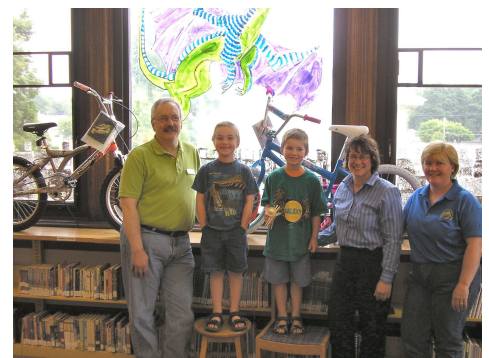
McDonald's donates bikes and prizes for Summer Reading Program at the library.

A BIG Thank You to McDonald's for their continued support.