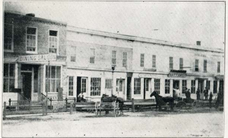
South Side of Chicago St. Looking West from Turner Store, June 27, 1864