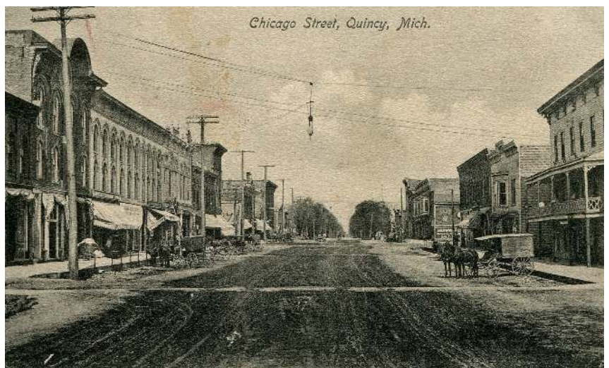
Chicago Street, Quincy, Mich.