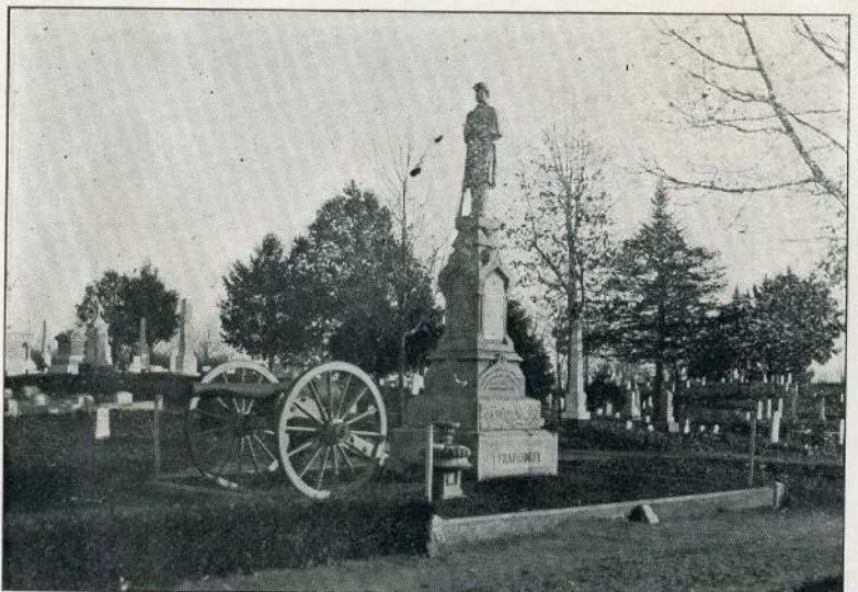
SOLDIERS' MONUMENT, LAKEVIEW CEMETERY