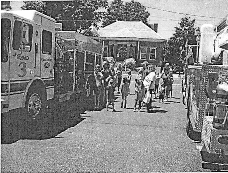
Quincy Firemen share important safety information with children and provided wonderful goodie bags!