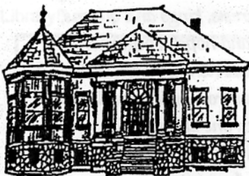
Quincy Public Library 1910

Non-Profit U.S. Postage Paid Permit No. 5 Quincy, MI