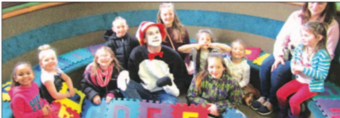
March came in like a lion at the Coldwater Kids' Place of the Branch District Library as the Cat in the Hat came to play March 2. He led a group of children astray with stories, games and crafts.