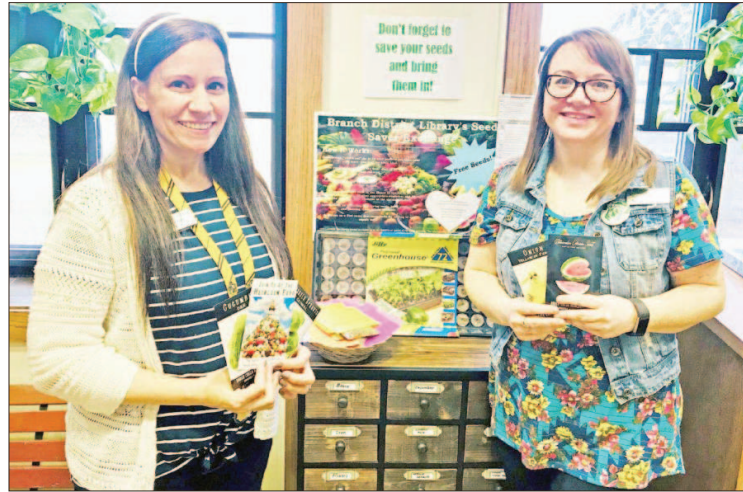
Library Staff show off some of the Seeds from the Seed Library.