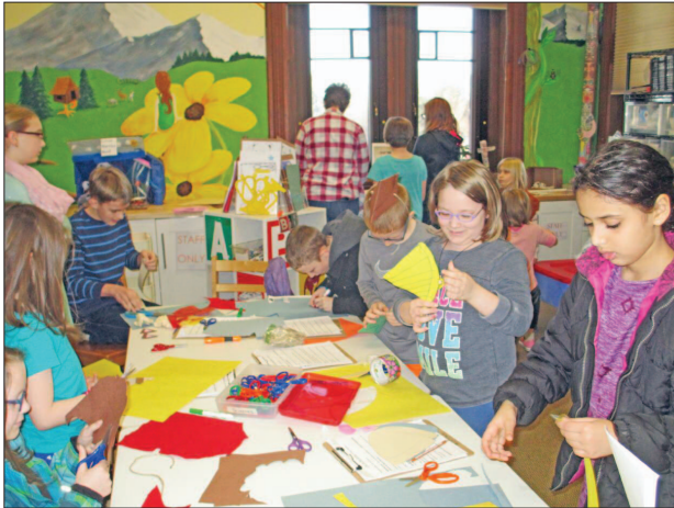
Branch County youth spent their staycation during winter break at the Coldwater branch of the Branch District Library's Kids' Place participating in various activities.