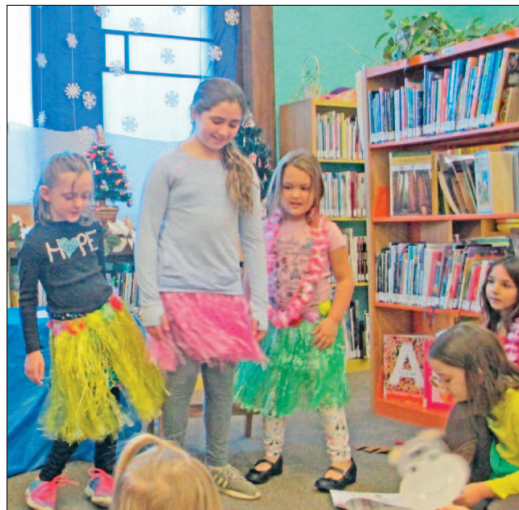
Local youth enjoy music and story telling during the holiday kick off event at the Coldwater branch of the Branch District Library's Kids' Place earlier this month.

The large and lively audience participated in the interactive seasonal music, See, KIDS' PLACE, Page A4