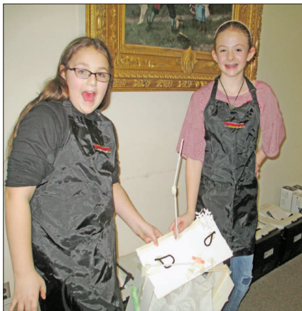
Two area youth show off the snowman they made during the Stem Snowmen Building Challenges at the Coldwater branch of the Branch District Library's Kids' Place.