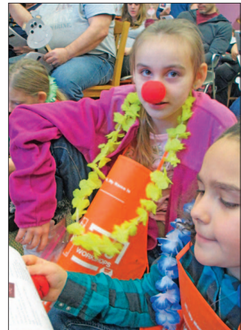
Two youth show off their festive spirit during the holiday kick off event at the Coldwater branch of the Branch District Library's Kids' Place earlier this month.

The free event will offer area youth a photo frame and letter to Santa craft as well as a visit