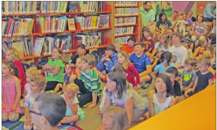
Dozens of local youth attended a recent event at the Coldwater branch of the Branch District Library.

COLDWATER— The summer got a great start with Kids' Place of the Coldwater branch of the Branch District Library Wednesday.