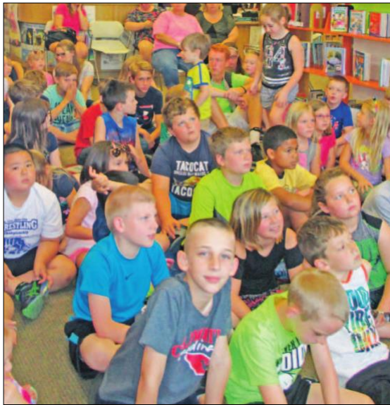
Dozens of local youth attended the recent event at the library.