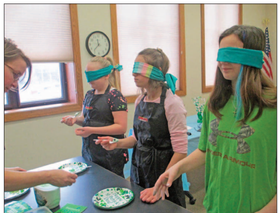
Local tweens enjoy St. Patrick's day themed events at the Coldwater branch of the Branch District Library.