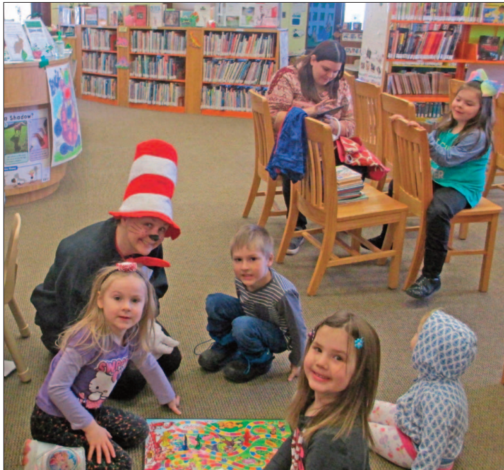
Above, local youth celebrate March is Reading month with Dr. Seuss' Cat in the Hat and below tweens celebrate St. Patrick's day with themed activities at the Coldwater library's Kids' Place.