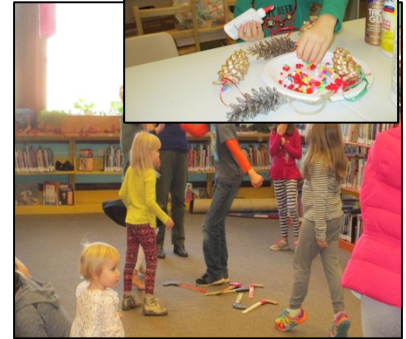
The Shiny! Game

Santa arrives at Kids Place on Saturday, Dec 16 for a stash of cookies and books! The first 50 families will receive a hardcover copy of "The Legend of St. Nicholas", along with an opportunity for a professional family portrait and a chance to write a letter to the jolly elf!