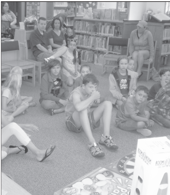
Participants in the Dearth Union Township Branch District Library Summer Reading Program attend the Summer Reading Party on Saturday, July 29.

Sherwood Library held their Summer Reading Program Party on Tuesday, July 25. Those that completed the Reading Program were entered to win many prizes.