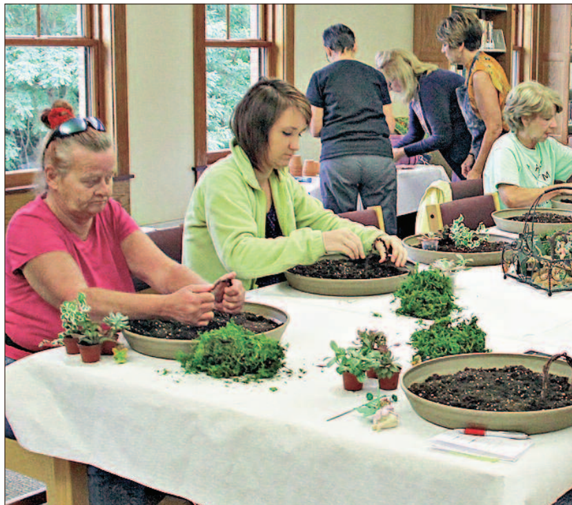
Attendees work on creating their fairy gardens during an event at the Union Township Library on Aug. 24. The workshop was part of the "Build a Better World" summer library program.

For information on future library events, visit branchdistrictlibrary.org .