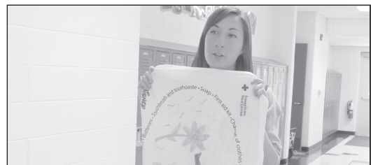
A representative from the American Red Cross introduces the pillowcase Project to students.

Each child at the event was given a pillowcase, which they decorated, and a “My Preparedness Workbook,” which informs them of possible emergency situations in their area, steps to prepare, and items to pack in their pillowcase and home and vehicle emergency kits.