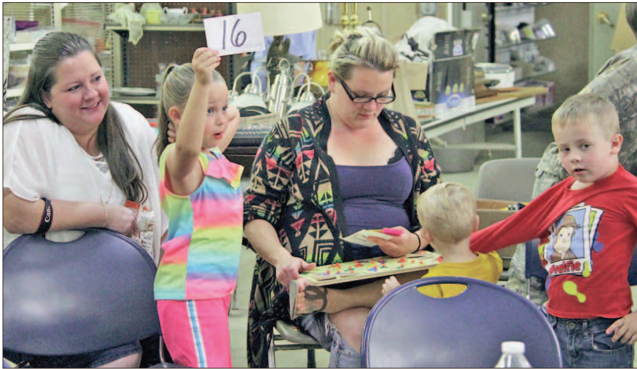
Fun bidding was took place for games, toys, candy and arts and crafts during the "kids only" auction, part of the "FunRaiser" event for the Bronson Library, which was held Saturday at White Star Auction in Bronson.