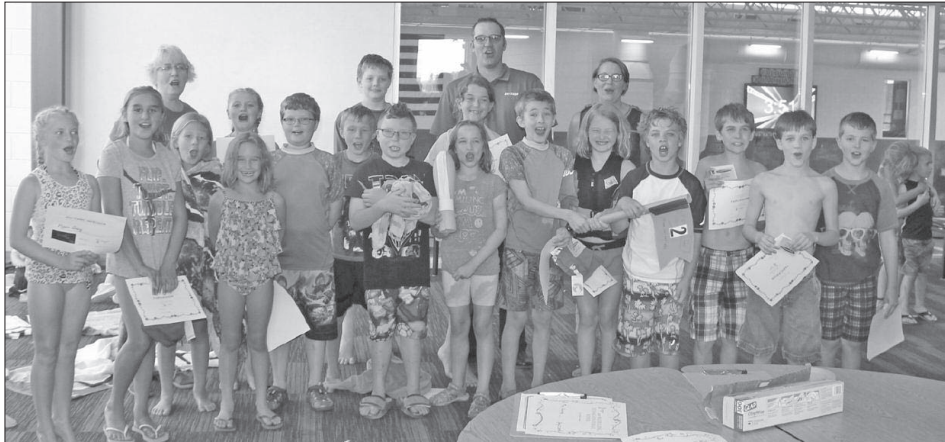
Over a dozen local tweens showed off their cardboard boat building and floating skills Thursday at the aquatic center for the Coldwater branch of the Branch District Library's boat race event.

Prizes were donated by Coldwater Lake Marina, The Aquatic Center, McDonalds, Adventure Zone and the Branch County Fair.