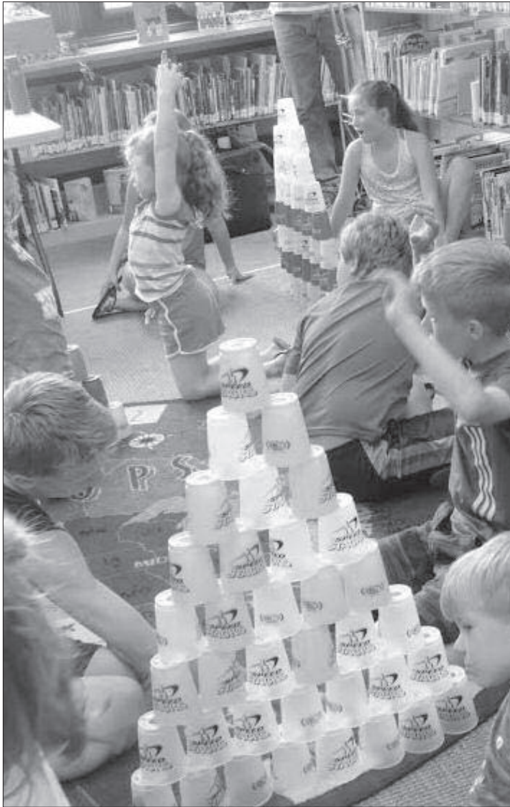
Children at the Coldwater branch of the Branch County Library had fun building with cups as part of the 'Build a Better World' themed summer program.