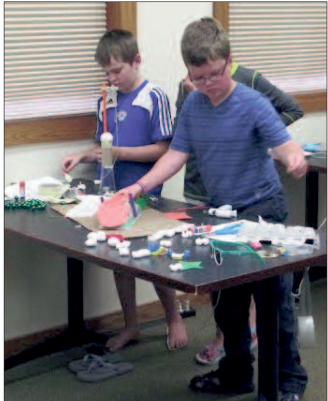
The Creative minds of youngsters are put to the challenge at the Coldwater branch of the Branch District Library.