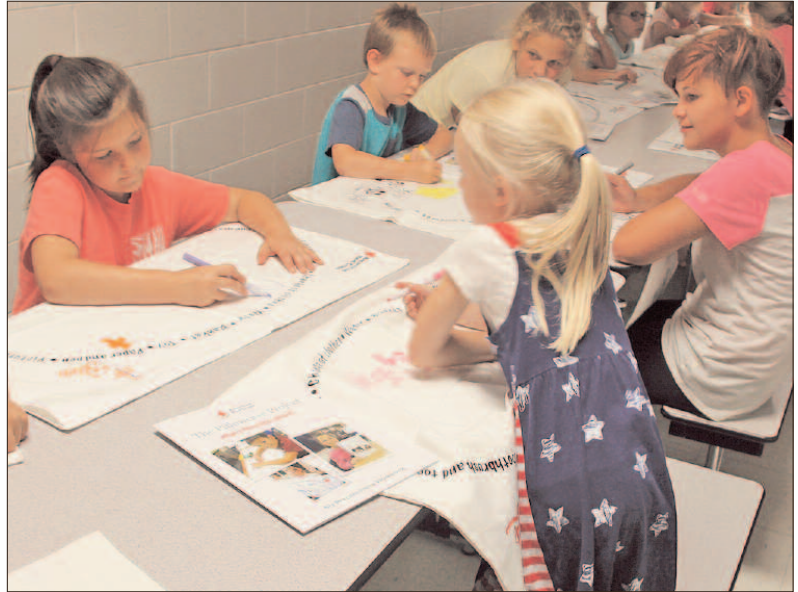
Students from the Union City Branch Library participate in the American Red Cross' "Pillow Case Project."

For information on future events at the library, visit BranchDistrictLibrary.org/union .