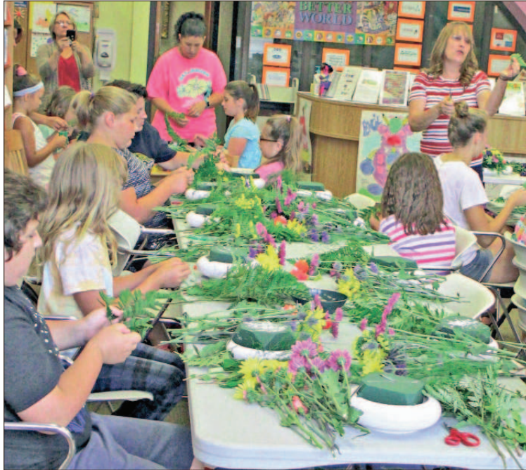
Above and below, youngsters at the Branch District Library participate in a floral arrangement class held recently as part of the library's summer program. The class was sponsored by the American Legion Auxiliary Unit No. 52.

August 7, 2017, Coldwater Daily Reporter , page A2: