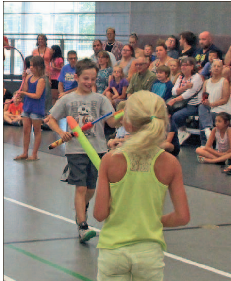
Above and below, children from the Branch District Library participated in an event by the Kalamazoo Air Zoo at the Henry Browne Recreation Center in Coldwater Wednesday.