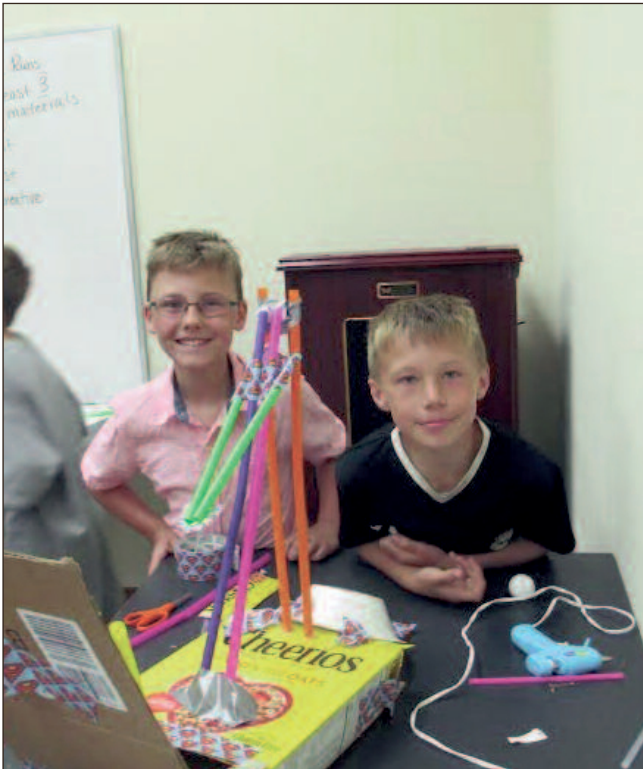
The 'Build a Better World' theme for this year's summer program at the Branch District Library, continues to entertain students of all ages.