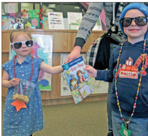
Two youth show off their new book provided by local businesses as part of the Money Smart Kids Read program.

For the event, the Kids Place partnered with Honor Credit Union. The youth received a $10 vouchers to open a personal See LIBRARY, Page A5