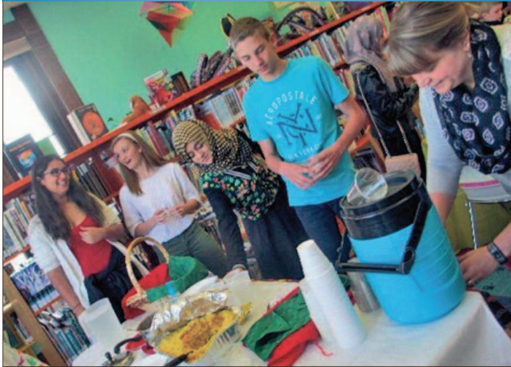
Local students enjoy traditional Mexican food and drinks during the Kiwanis Club of Coldwater's sponsored Traveling Tales Program held at the Kids Place Friday.