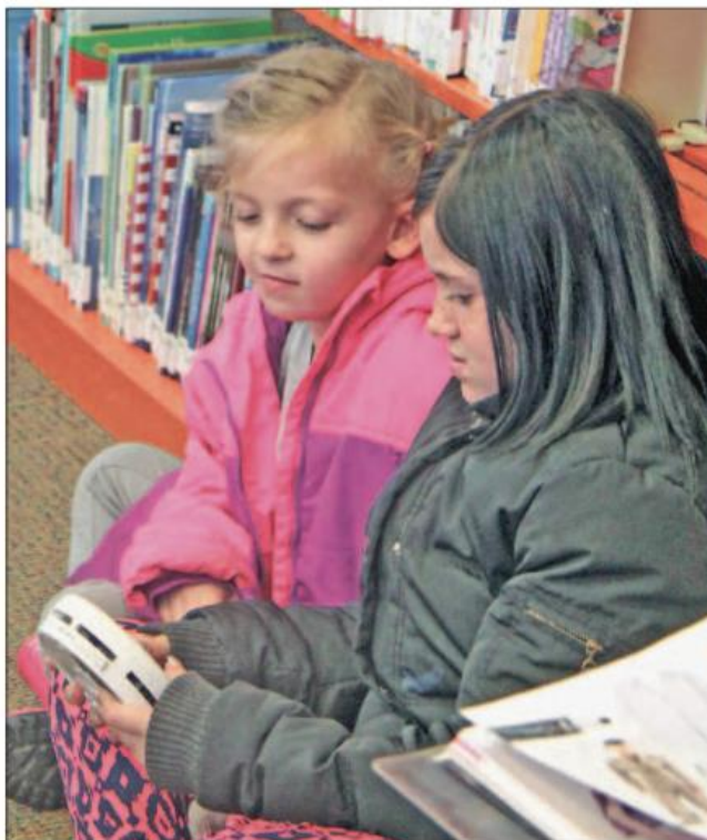
Two girls look at a smoke detector as the instructors of the library event discuss how one works and where they should be placed in a home.

Students learned coping skills and how to stay safe during an emergency. They also received a pillowcase to personalize as a preparedness kit.