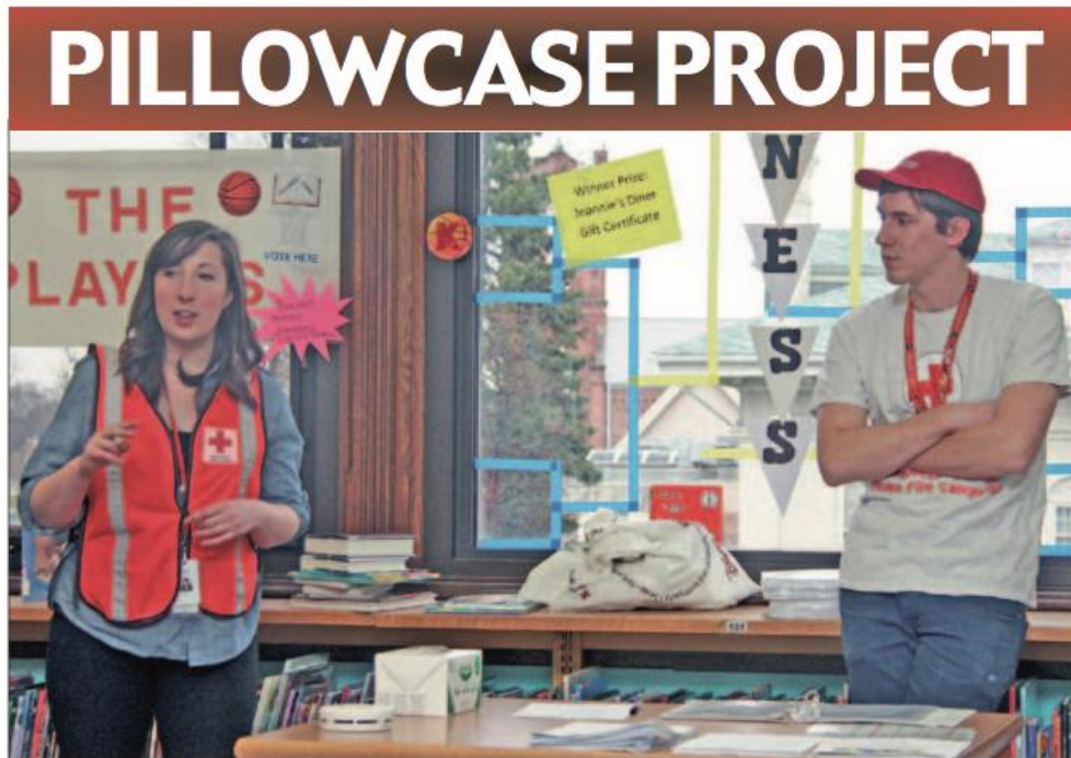
Instructors from the Red Cross discuss the types of natural disasters seen throughout the United States and more specifically in Michigan.