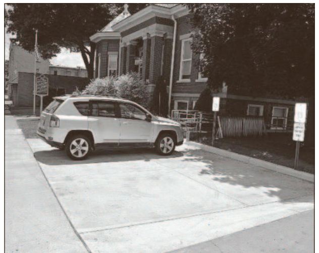
New handicapped parking completed at Quincy Library/township hall.

Once plans are issued from the architect, bids can be taken for the work to finalize repairs. The slate roof was already replaced on the historic building.