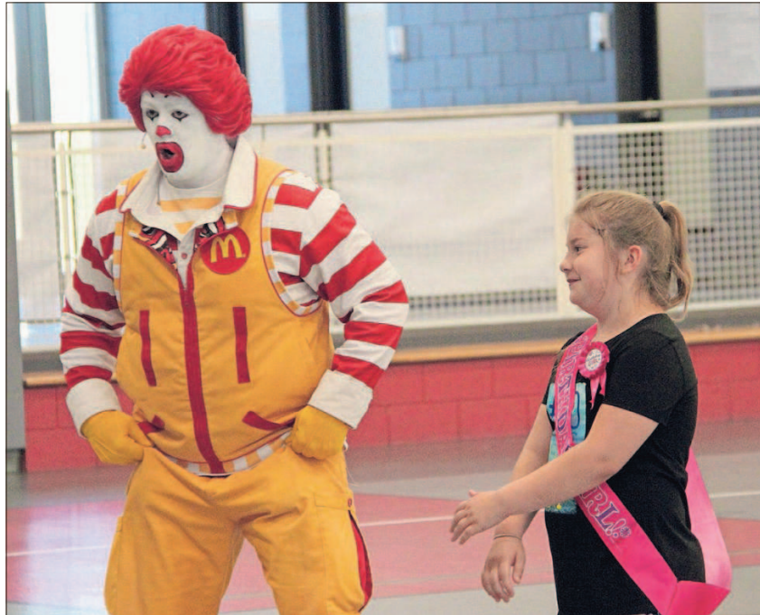
Ronald McDonald sings happy birthday to a little girl during the Summer Reading Program kick off on Wednesday.