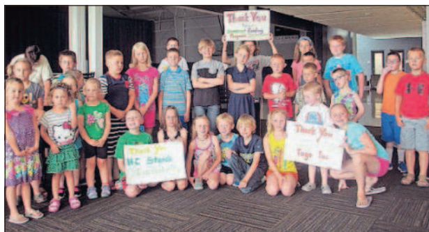
The library hosted a Ring of Steel event last week as part of its Summer Reading Program. The event sponsors were Quality Springs/ Togo Inc and H.C. Starck Manufacturing.