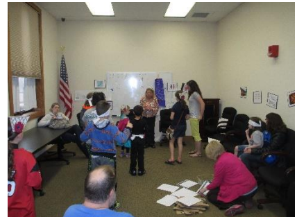
Thanks to Coldwater Kiwanis for their sponsorship!