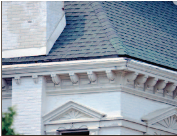
The rotten gutters on the original Branch County library are hidden behind the trim and will need to be replaced.

city needs to provide a one-time assistance with this repair to continue to maintain the structural integrity of the building,” Budd said. “I am not sure the library could afford to make all the repairs.”