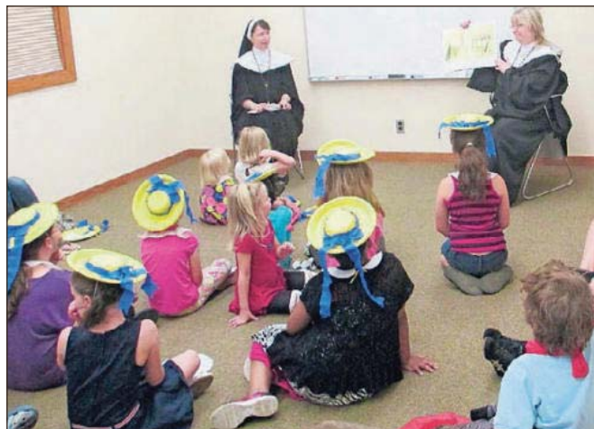
Many dress the part of characters in the Madeline books.