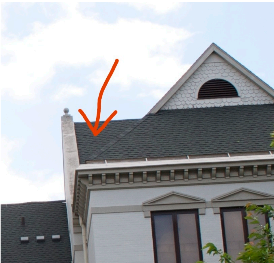
3 rd floor leak, west side of 1979 portion of building