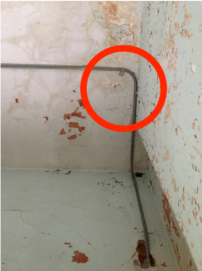
New active leak (red) above old main entrance in local history room