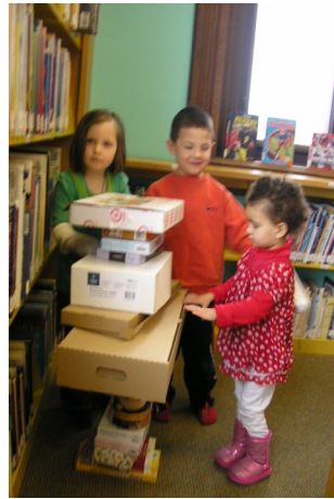
(Tower building like Thing 1 & Thing 2 would do.)

Reading logs will be available for patrons ages 0-12th grade to complete during the month of March. Upon reading the minimum or above for each age appropriate level,