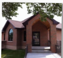
Union Twp. Branch